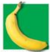
1 medium banana