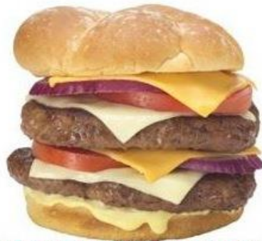
DOUBLE BYPASS BURGER®