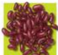
3 heaped tablespoons of cooked kidney beans