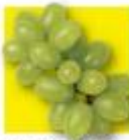
1 handful of grapes