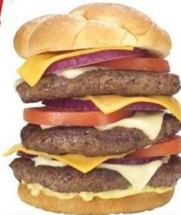
TRIPLE BYPASS BURGER®