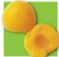
2 halves of canned peaches