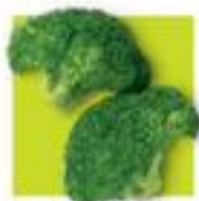
2 broccoli florets