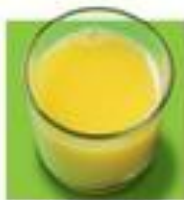
1 medium glass of orange juice