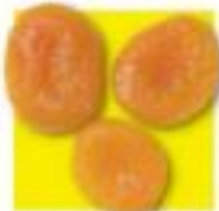
3 whole dried apricots