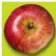
1 medium apple