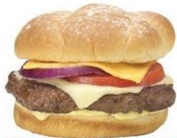
SINGLE BYPASS BURGER®