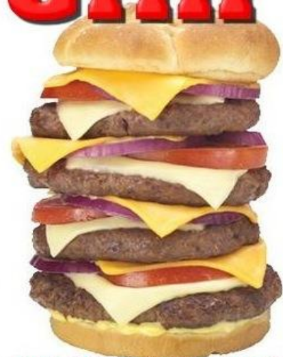
QUADRUPLE BYPASS BURGER®