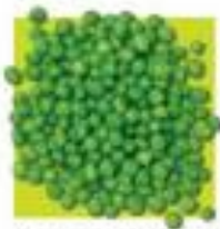
3 heaped tablespoons of peas